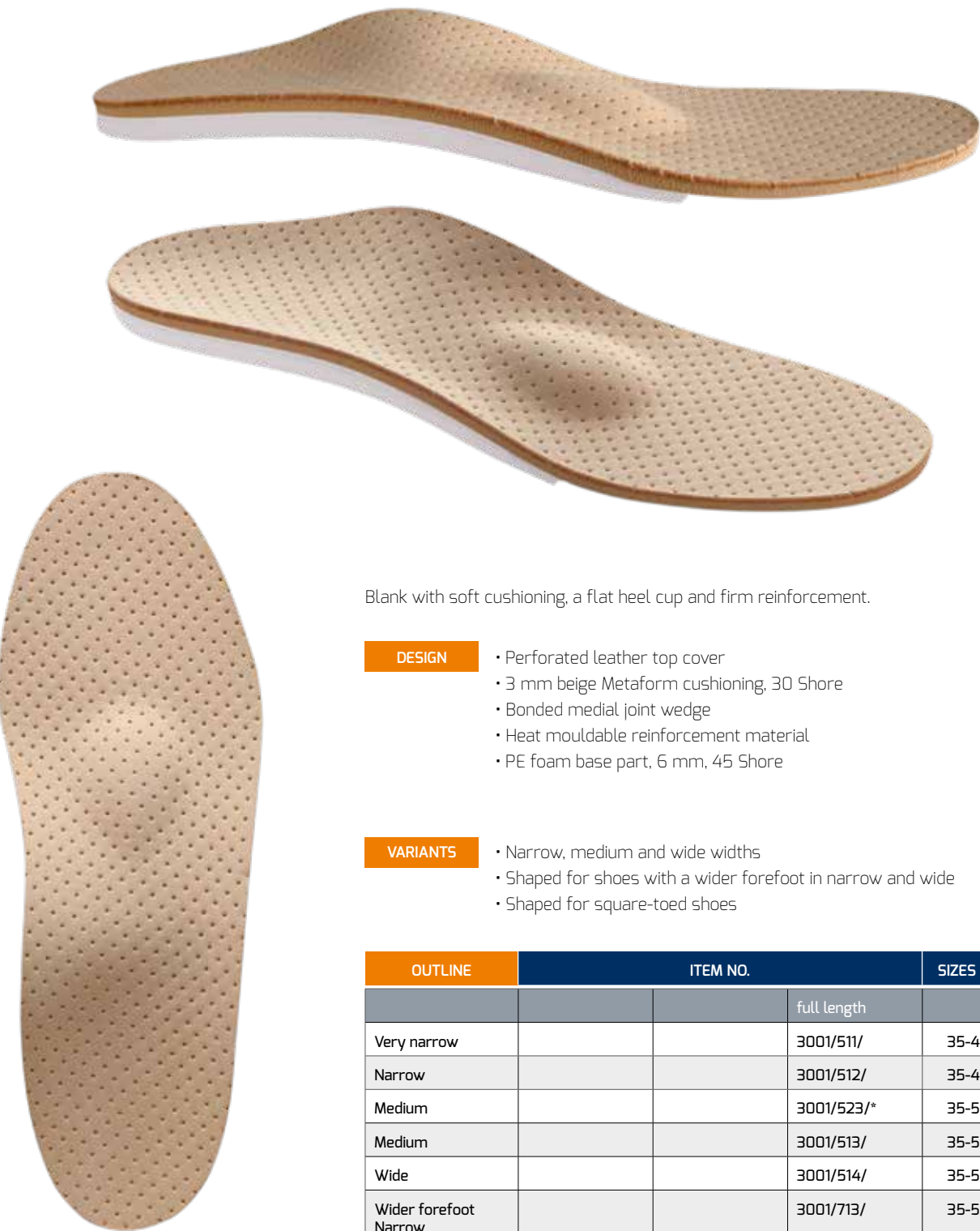
Blank with soft cushioning, a flat heel cup and firm reinforcement.

Item No.: 3001/523/2221220/0000 Blank with soft cushioning and a perforated leather top cover