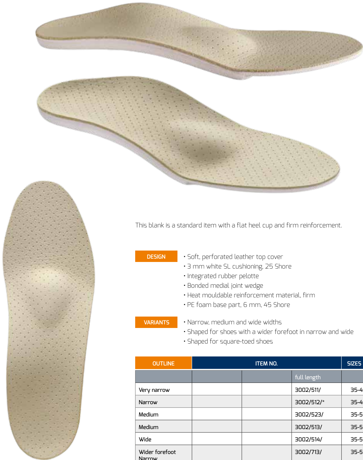
This blank is a standard item with a flat heel cup and firm reinforcement.

Item No.: 3002/512/2211220/0000 Blank with soft cushioning and a perforated leather top cover